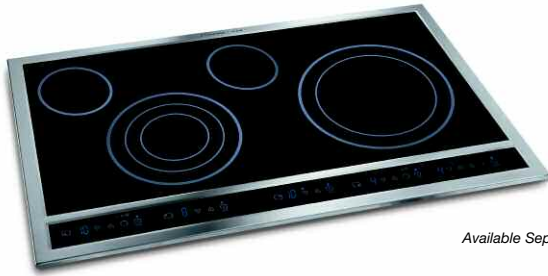
Available September, 2006.