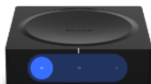
Next/Previous (Music only)