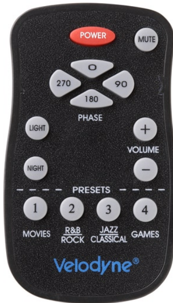
Figure 3. Remote Display

Figure 3 shows the remote control, enabling you to easily choose whatever listening mode you desire.