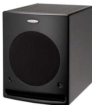
DSP-Controlled Home Theater Subwoofer