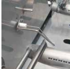
SPARK IGNITION SYSTEM