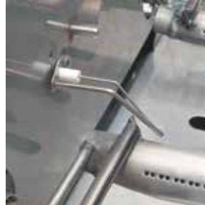
SPARK IGNITION SYSTEM