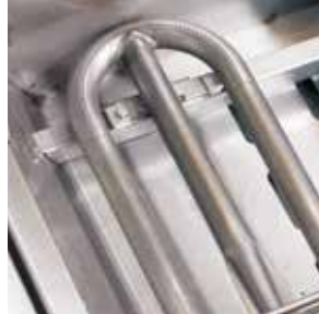
STAINLESS STEEL BURNERS