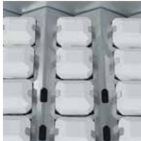
CERAMIC RADIANT BRIQUETTES