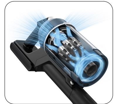
Advanced Cleaning Performance