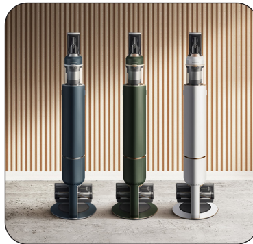
Contemporary and Premium Design