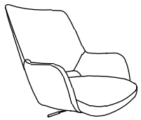
A (1 pc)