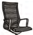
A (1 pc)