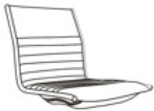
A (1 pc)