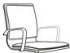
A (1 pc)