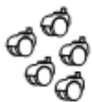
E (5 pcs)