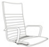
A (1 pc)