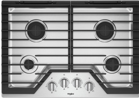
Stainless Steel WCG55US0HS