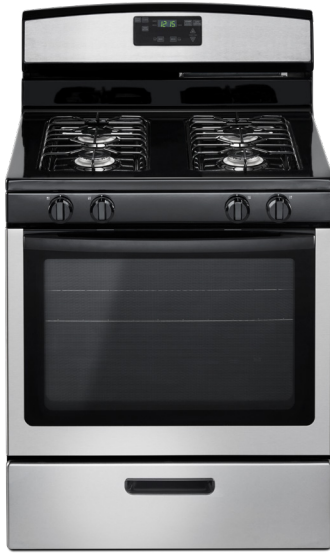
Stainless Steel AGR5330BAS