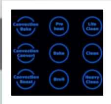
30" SINGLE WALL OVEN E30EW75EPS