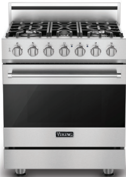
30" Wide Gas Self-Clean Range (Shown with optional 6" H. backguard)