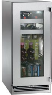
Glass Door Model

HP15BS-3 15" INDOOR MODEL HP15BO-3 15" OUTDOOR MODEL