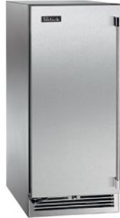
Solid Door Model