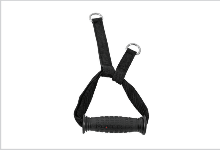
089983 – HAND GRIP