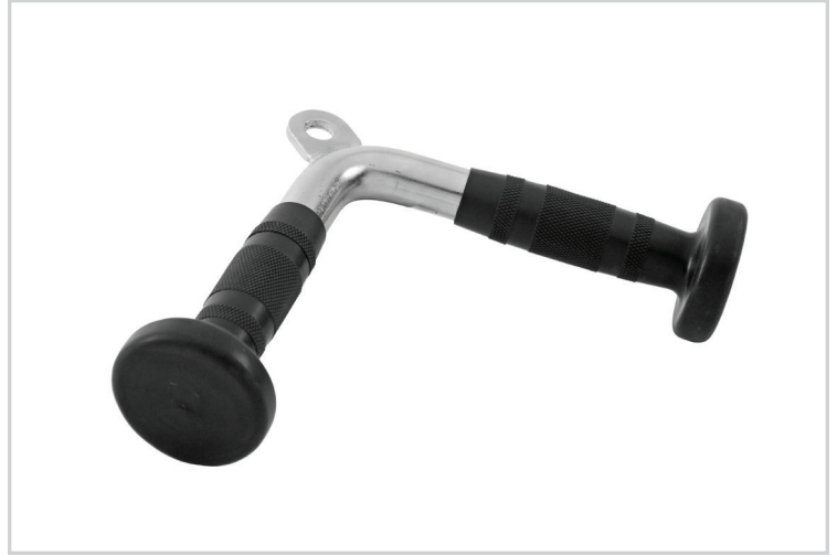
009250-A – PRESSDOWN BAR