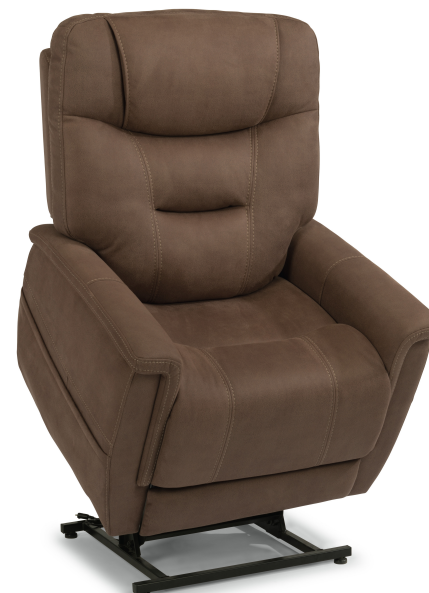
1916-55PH in fabric 500-74