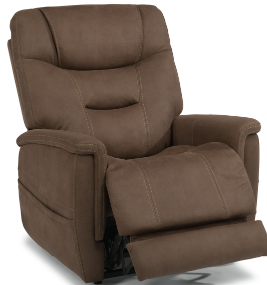
1916-55PH in fabric 500-74