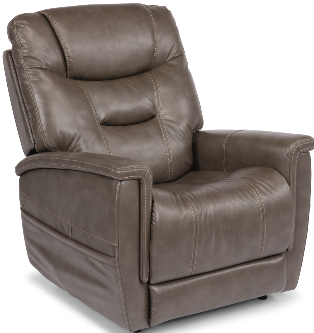
1916-55PH in fabric 039-01