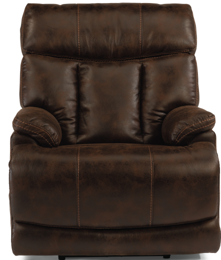
Fabric Power Recliner with Power Headrest 1594-50PH in 374-70