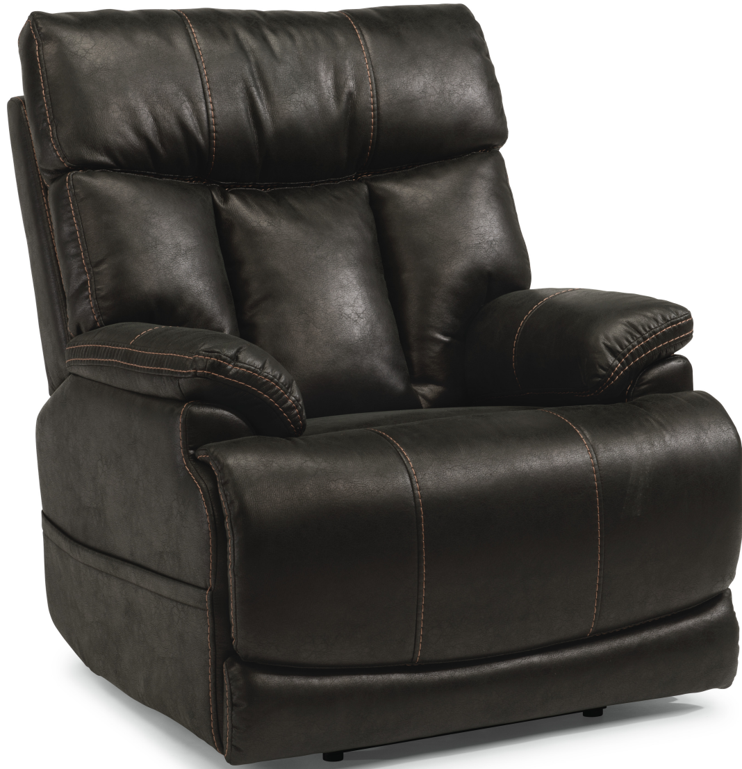
Fabric Power Recliner with Power Headrest 1594-50PH in 374-00