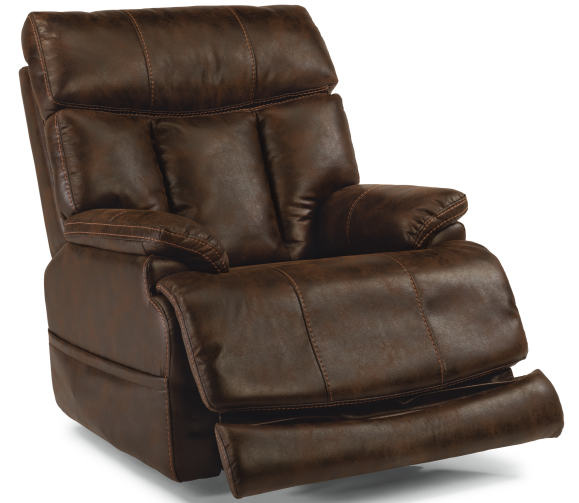
Fabric Power Recliner with Power Headrest 1594-50PH in 374-70