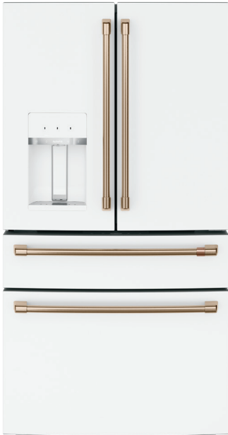
CVE28DP4NW2 Matte White with Brushed Bronze handles