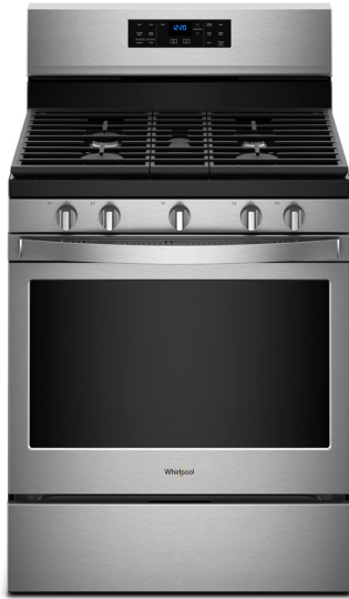
Fingerprint-Resistant Stainless WFG550S0HZ