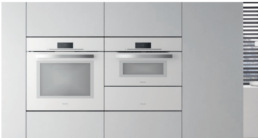
Side-by-side combination 30" Convection Oven with 30" Speed Oven and new Warming Drawer