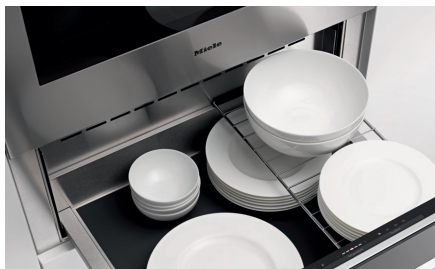
Movable half rack insert