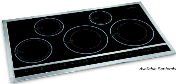
Available September, 2006.