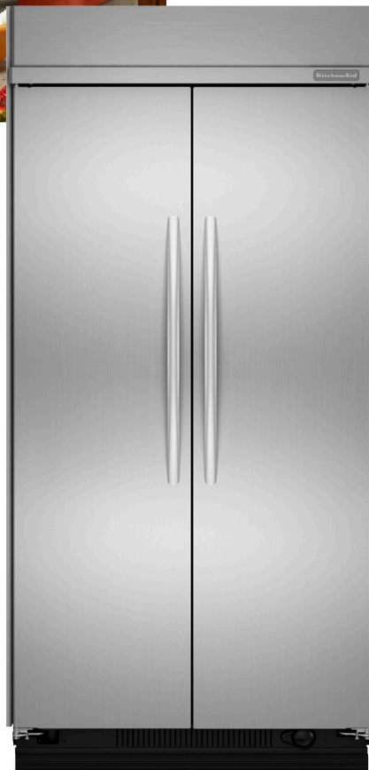
Stainless Steel KSSC42FTS