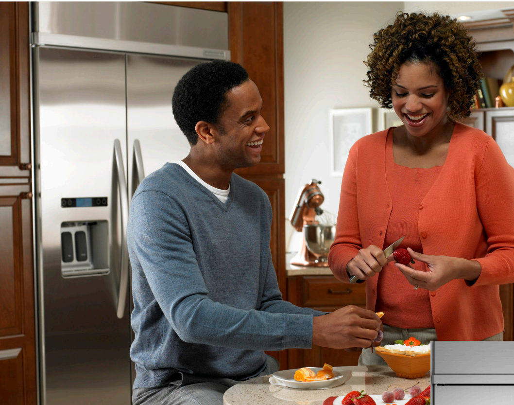
Cabinetry by Shenandoah Cabinetry®. Zodiac® Quartz Surface by DuPont.

Keep your favorite ingredients tasting as fresh as the day you bought them. The ExtendFresh™ Plus Temperature Management System independently monitors temperatures to help ensure maximum taste and texture.