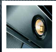
36" WALL-MOUNT RANGE HOOD E36WC45FSS designer series